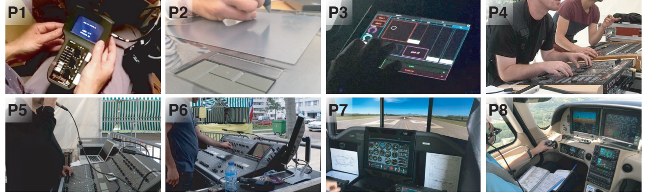
Figure 2. Participants using knobs and sliders in their professional activity: (P1) a cameraman with 4 knobs and a slider on a custom made device; (P2) a graphic designer using a graphic tablet and a slider placeholder; (P3) a light artist using custom knobs and sliders on a tablet in a dark environment; (P4) a light engineer using physical knobs and sliders while observing a stage; (P5) a sound engineer communicating with musicians on the far stage while using sliders; (P6) a sound engineer controlling a knob while watching a screen; (P7) a pilot using flight simulator for his training; (P8) a pilot using physical controls in a flight.