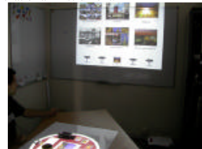
Figure 3: The GLOSS system multi-surface setting.

information. It can be placed into grid cells to move information. As such, it is an instrument. In addition, a video-projector displays specific information on the top of the puck: it serves as a surface as well. As expressed in Figure 2 (using Coad's role pattern (Coad, 1992)), an interaction resource may play multiple roles: that of a surface and/or that of an instrument.