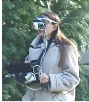
Figure 1. A user wearing and holding the hardware platform

The mobile users manipulate objects that are either digital or physical. Interaction techniques must be designed in order to let them manipulate the two types of objects: physical and digital. For flexibility and fluidity of interaction, such manipulation is either in the physical world or in the digital world. We therefore obtain four cases, by combining the two types of objects and the two worlds: the physical world (i.e., the archaeological field or the game ground) and the digital world (i.e., the screen of the pen computer):