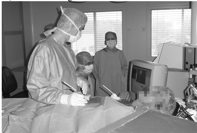
Figure 1. Our CASPER application in use.

In CAS systems, Augmented Reality (AR) interaction techniques are based on the fusion of two worlds: the digital world (e.g., MRI, scan images, computed trajectory) and the real world (e.g., the patient's body, a needle). However, there is no consensus on a definition of AR techniques highlighting the problem of delimitating the frontier between the two worlds [2] [7]. As we defined in [2], the adapters are devices in charge of the fusion between the two worlds. We distinguish input adapters (inputs to the system) from output adapters (outputs from the system). The input adapters, such as an electro-magnetic localizer or a video camera, capture information from the real world that is transferred to the computing system, while the output adapters, such as a projector or a Head Mounted Display (HMD), convey information from the digital world to the real world. The results of the fusion thanks to the output adapters are either perceived in the digital world (e.g., a 3D brain model and a video of a patient merged on a screen [5]) or in the real one (e.g., a 3D model projected onto the patient's body [1] [4]). For example, using CASPER, a computer-assisted pericardial puncture application, the surgeon must look at the screen to get the guidance information, as shown in Figure 1.