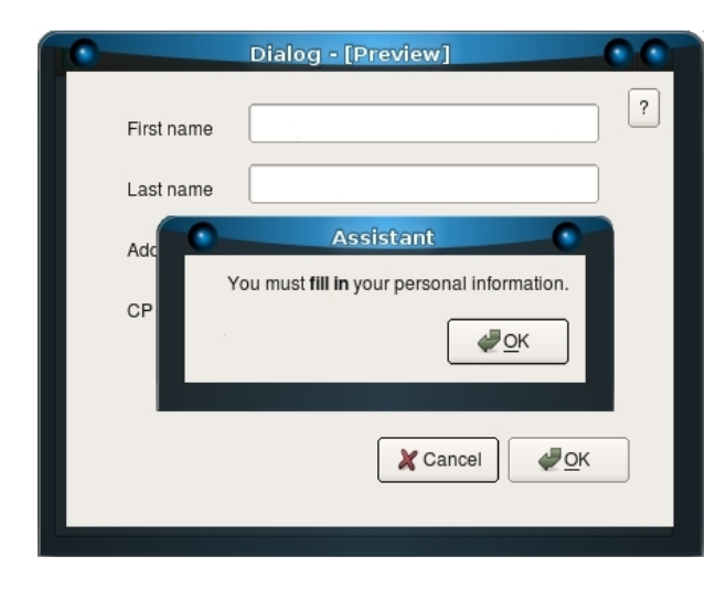
Figure 1. A help message leads the user through the UI.

model-to-code compilation rules [2]. However, whatever the apporach is (MDE or MB-UIDE), none of the automatically generated UI have enough quality, forcing designers to manually tweak the generated UI code [2]. Design knowledge can not be always explicitly represented into the models, but it has a potential to help users. Some of the models of the MDE approach as for instance the task model have this potential explicitly represented, and they can contribute also to guide and help the user.