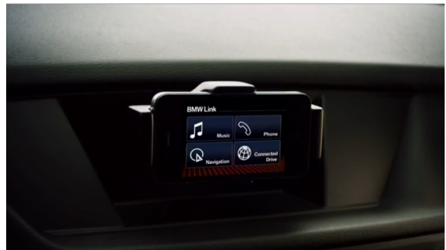
Figure 1. Integration of last generation mobile devices in automotive environment rise the necessity to analyze gestural interaction technique from their cognitive load point of view [?].

Last generation mobile devices are enhanced with a diversity of sensors capable of probing real world physical properties in real time. The pioneering work on sensor-based interaction techniques [8, 11, 12, 15, 16] has paved the way for an active research area [1, 20, 21]. Although these results satisfy “the gold standard of science” [19], in practice, they are too “narrow truths” [4] to support designers decisions and researchers analysis. Designers and researchers need an