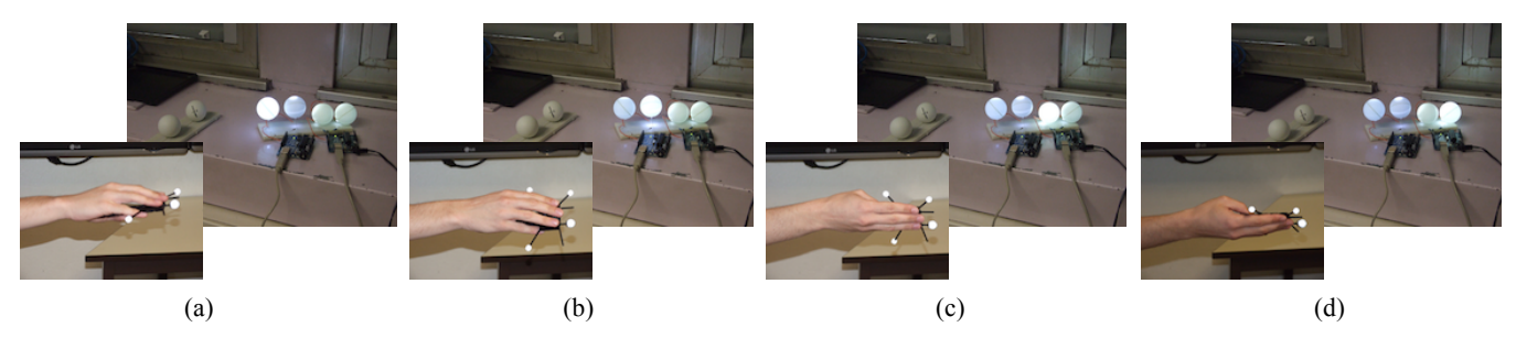
Figure 1: A pointing gesture turns on the lights of the current selected volume at medium brightness (a), and a rolling gesture (b, c, d) changes the current selected object (at maximum brightness) to the next one.