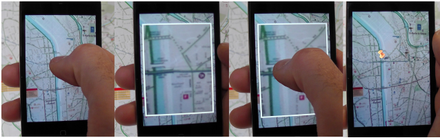
Figure 4: AR TapTap: First tap (left) to freeze and zoom the video (center); Second tap to place the mark (center) and automatically close the frozen and zoomed view (right).

Inherited from TapTap, the interaction is very fast, making it practically like a transient (or temporary) transition. The first selection tap provokes a transition along the axis Spatial mapping with the physical world (from conformal to none in Figure 2). The second tap for placing a mark also terminates the frozen and zoomed view returning thereafter to the initial state along the axis Spatial mapping with the physical world (i.e., conformal mapping - live video playback). In order to allow accurate placement of marks, AR TapTap therefore implements an explicit modification of the spatial mapping between the physical world and its representation with a first selection tap. This modification is transient since the second selection tap is not dedicated to changing the current mode (from none to conformal in Figure 2) but rather to placing a mark. As such, with AR TapTap, the frozen mode is only maintained for one mark placement. On the one hand, by placing the mark, the user also modifies the spatial mapping between the physical world and its representation : It is therefore a transient mode since no extra action from the user is required to explicitly change the mode. On the other hand, an additional third tap in order to change the mode after placing the mark would be a case of explicit transition between two sustained modes as in [10, 18, 7].