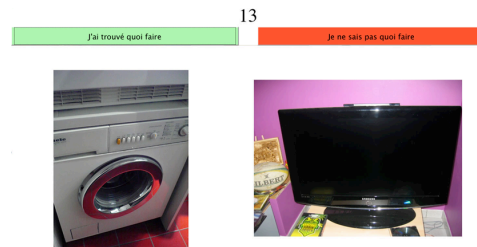
Figure 3. An example of two play cards association presented on a tablet and its related question: "What services, whether it be useful or not, could results from a communication or cooperation between your washing machine and your TV?"

To perform end-user studies in the home, we must respect temporal and cognitive constraints of inhabitants, as well as the privacy of their intimate personal space. Used in isolation, interviews, journal studies, and playful cultural probes [1] are unable to comply with such requirements. This problem may be avoided by a complementary combination of multiple techniques [4, 6, 11, 16]. Among these techniques, a particularly effective approach is to visit the home with the inhabitants. The challenge is to do this without having observers intrude on the inhabitant's personal space.